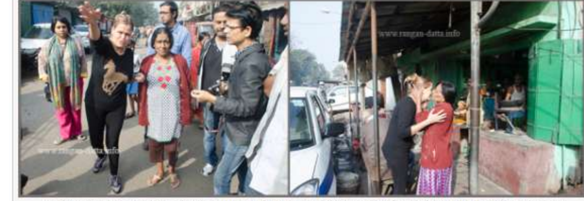
L: Showing her old neighborhood and R: Meeting old friend in Kidderpore, Kolkata